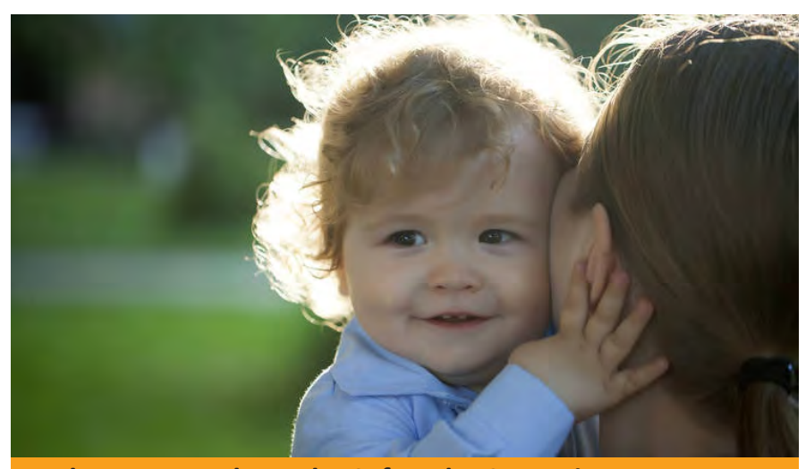
To learn more about the Safe Baby Courts in Tennessee and Zero to Three's Safe Baby Court Teams™ approach click here.

passed for the implementation of Safe Baby Courts (SBC), which is a practice model focusing on children ages zero to three with an emphasis on infant mental health, trauma recognition through Adverse Childhood Experiences (ACES), and increasing community resources and involvement to support families. The goals outlined for this practice include the reduction of children entering custody, reduction of time to permanency and the reduction of repeat involvement with child welfare. With the full support and collaboration of the Administrative Office of the Courts (AOC) and the Department of Mental Health and Substance Abuse. the Department of Children's Services has established seven (7) SBC's throughout TN with a focus on parents impacted by substance abuse, particularly involving opioids in many of the cases. Tennessee is the first state to implement this approach focusing on prevention to keep