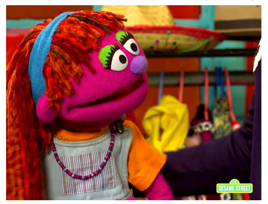
Lily, a seven-year-old Muppet, whose family is staying with friends on Sesame Street after losing their home.