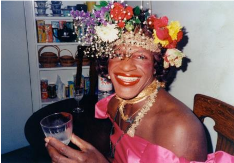
Marsha P. Johnson

Marsha P. Johnson was a transgender rights activist and has been designated by some as a queer saint. She was a loud and colorful personality who was popular in New York City's gay, art, transgender and activist communities from the 1960s until the '90s. Marsha took part in Andy Warhol's "ladies and gentlemen" series of photographs and in the flamboyant theatrical troupe, Hot Peaches. She was one of the first people to fight back against the police at the Stonewall Inn in 1969, screaming for her civil rights. Marsha told the judge during a court case that the P. in her name stood for "Pay it No Mind," which became her trademark. She, along with Sylvia Rivera, founded Street Transvestite Action Revolutionaries (STAR) in the early '70s, and they were the mothers of STAR House, which provided food, clothing and housing to transgender and non-gender-conforming youth in New York City, one of the first organizations to advocate for and support this population.